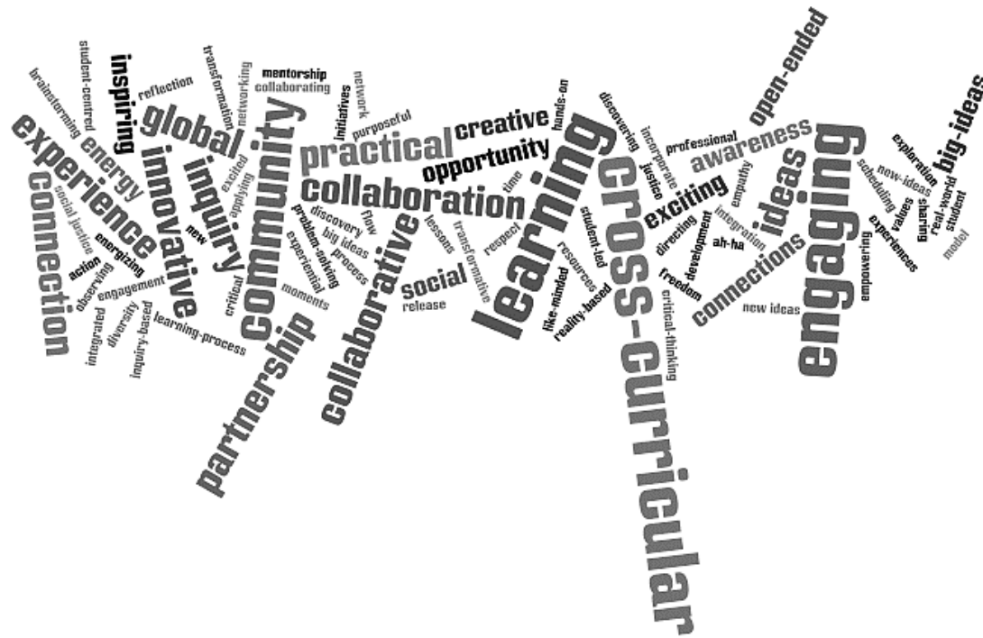
Figure 2: What participants found the most exciting, engaging, innovative, creative and/or transformative

Our network focused on PLCs developing and implementing curriculum and resources in priority areas that were identified by the Ontario Ministry of Education and the school boards—environmental education and collaborative inquiry. The following quotations from participant teachers indicate our success in generating and mobilizing knowledge in relation to the policy reforms: