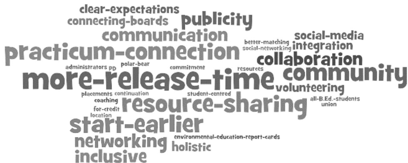
Figure 4. Participants' hopes for the network after the first year

professional learning workshops and research presentations, and/or meet with their PLC teams to develop curriculum that responded to the policy reforms.